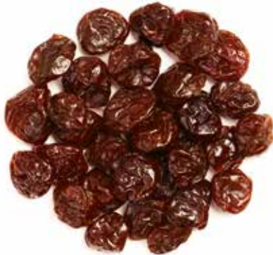
SWEETENED (W/APPLE JUICE CONCENTRATE) TART MONTMORENCY