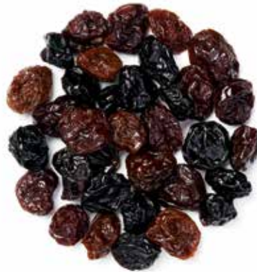
SWEETENED* CHERRY JUBILEE Montmorency, Balaton & Light Sweet