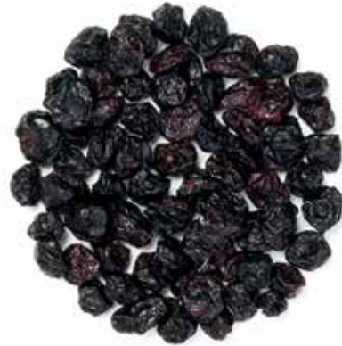
SWEETENED* LARGE CULTIVATED