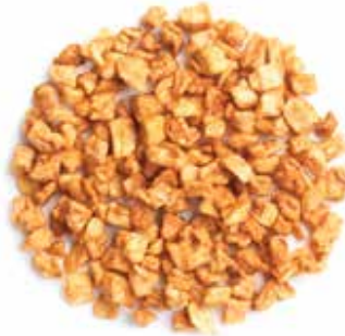
UNSULFURED DICES \frac{3}{8} \times \frac{3}{8} \times \frac{3}{8} inch