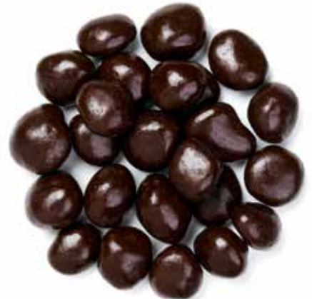
DARK CHOCOLATE COATED MONTMORENCY