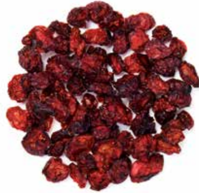
NO ADDED SUGAR SLICED