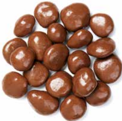
MILK CHOCOLATE COATED MONTMORENCY