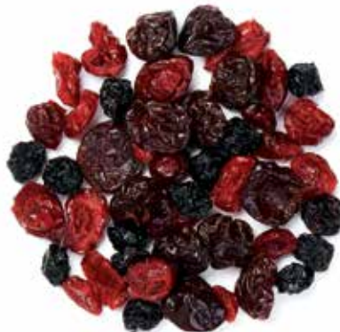
SWEETENED* CHERRY BERRY BLEND cherry, cranberry & blueberry