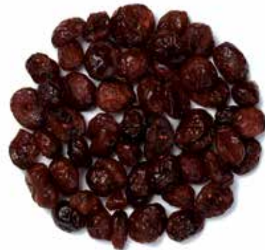
SWEETENED SLICED (W/APPLE JUICE CONCENTRATE)