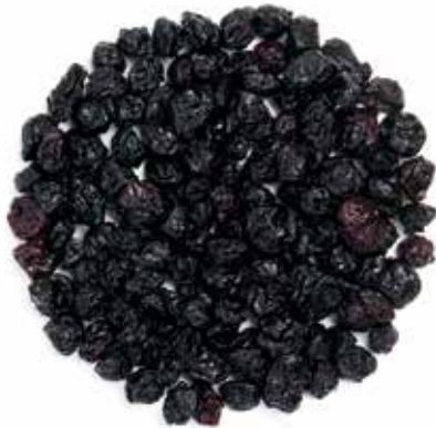
SWEETENED (W/APPLE JUICE CONCENTRATE)