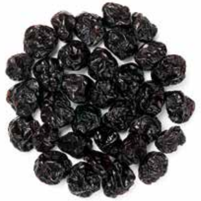
SWEETENED* TART BALATON