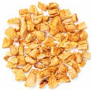
UNSULFURED DICES \frac{3}{4} \times \frac{1}{2} \times \frac{1}{4} inch