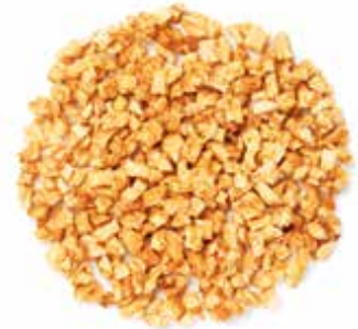
UNSULFURED DICES \frac{1}{4} \times \frac{1}{4} \times \frac{1}{4} inch