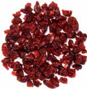
SWEETENED* DICED 3/16x1/4 inch